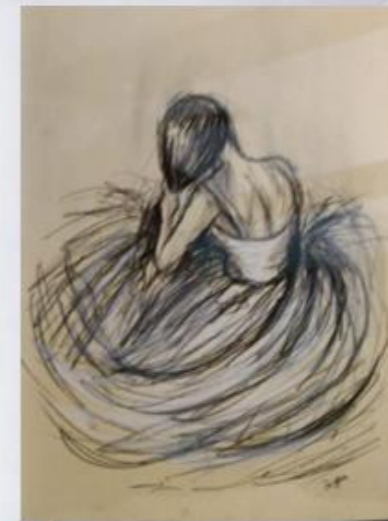
Edgar Degas (1834-1917)