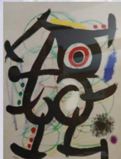
Joan Miro' (1893-1983)