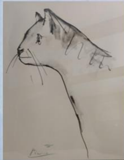
Pablo Picasso (1881-1973)

A collection of 100 signed etchings, prints, lithographs, paintings by 40 of the world's most renowned artists