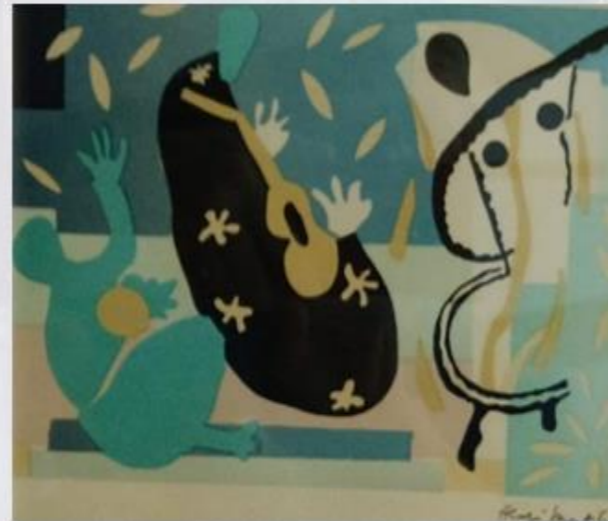
Henri Matisse (1869-1954)